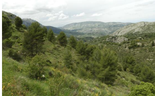
Views from the hills